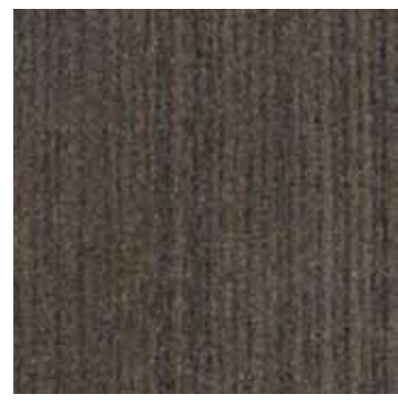
D&R Henderson Melamine